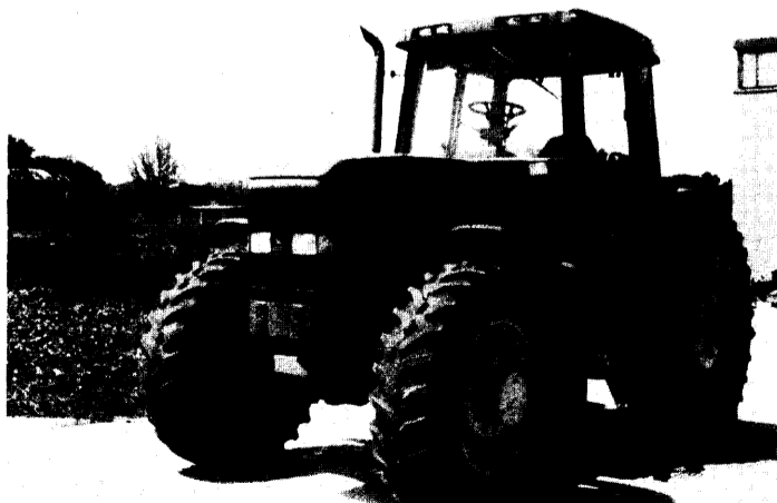
JOHN DEERE 7400 POWRQUAD DIESEL